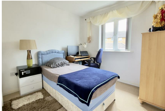
First Floor & Landing: